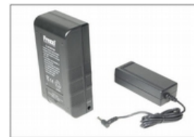
FLC-1 Compact Travel Charger for all FLB-Series