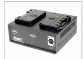
FLC-2 Dual Lithium Charger for AB