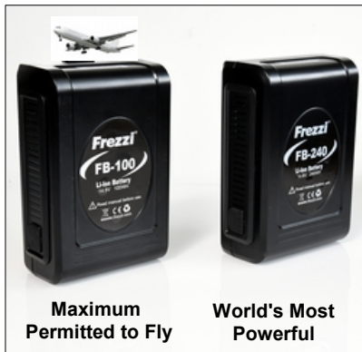
Maximum Permitted to Fly